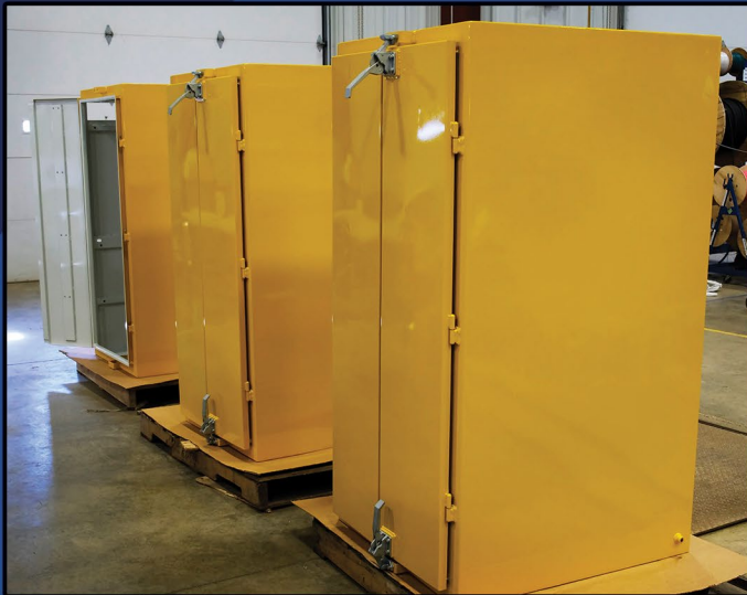
Fully Fabricated & Painted Electrical Cabinets